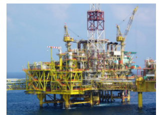
4. Install topsides