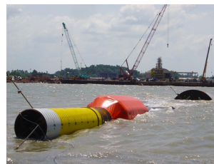
1. Wet tow to field