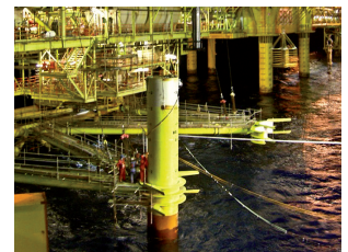
2. Upend and position